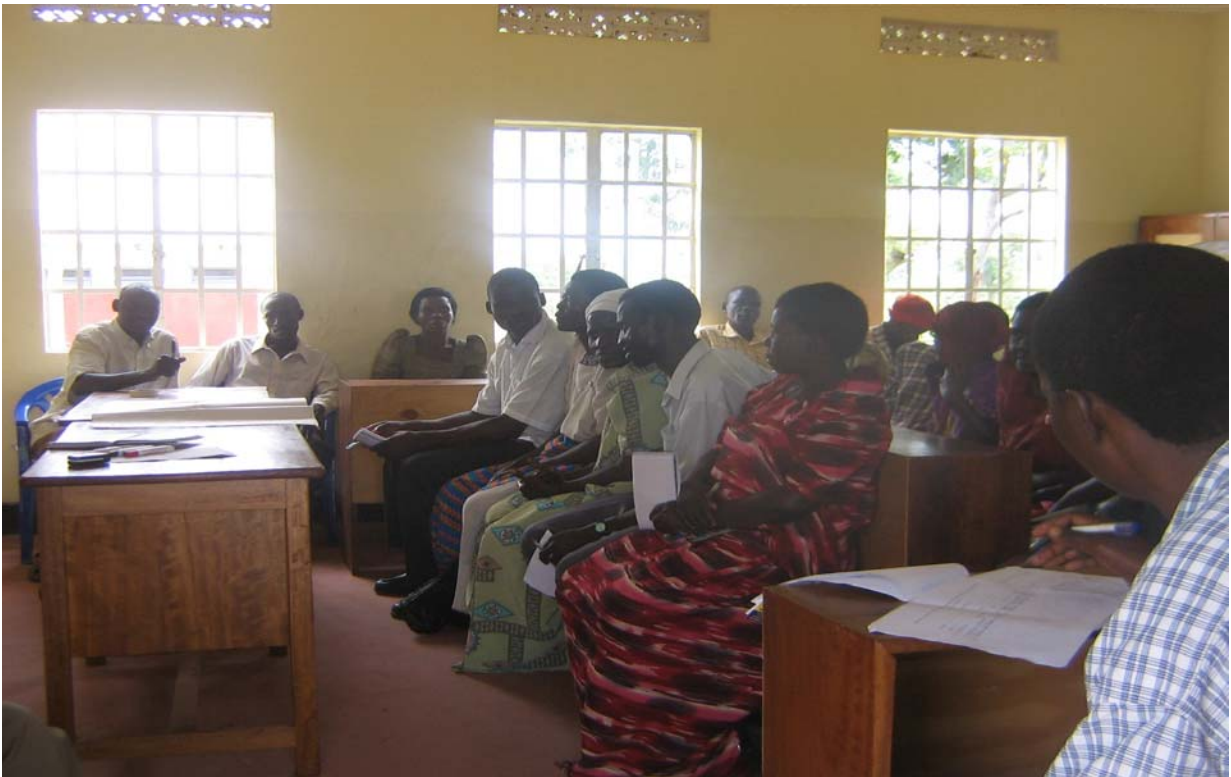
Rockford Harris Group Consultants with the Farmers' Forum,DOHO.

Market Needs Assessment and Enterprise Groups Identification